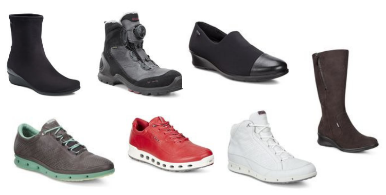
Ecco - Mens